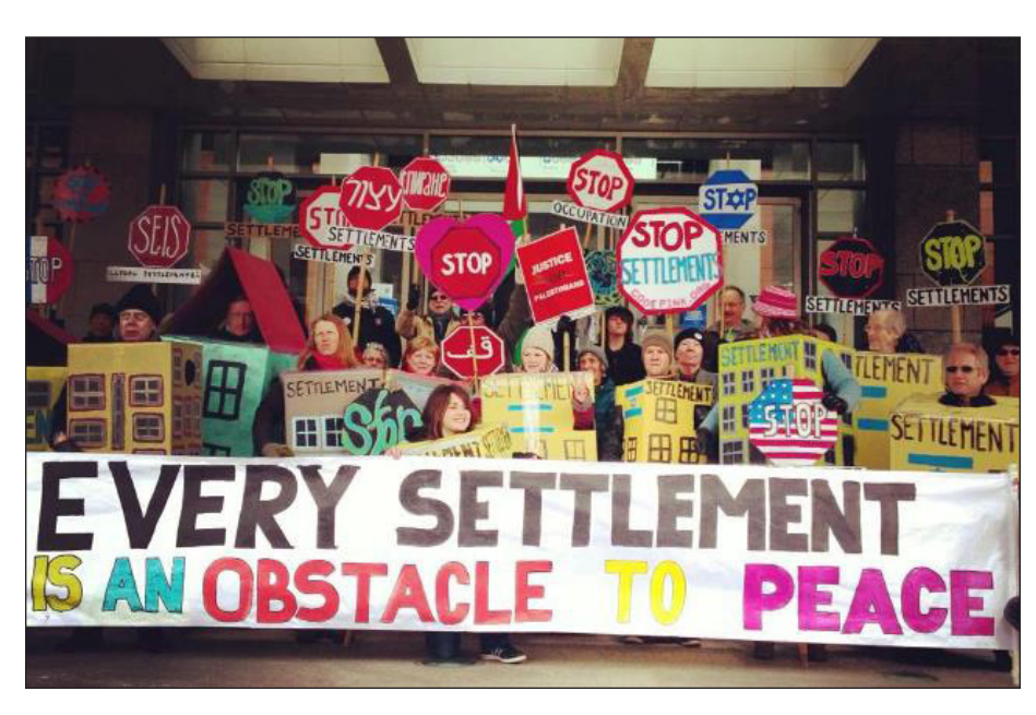
Photo of activists outside AIPAC conference

Pax Christi International will therefore support new initiatives by international civil society towards the end of Israel's settlements policy and the active ban of Israeli settlement products. §