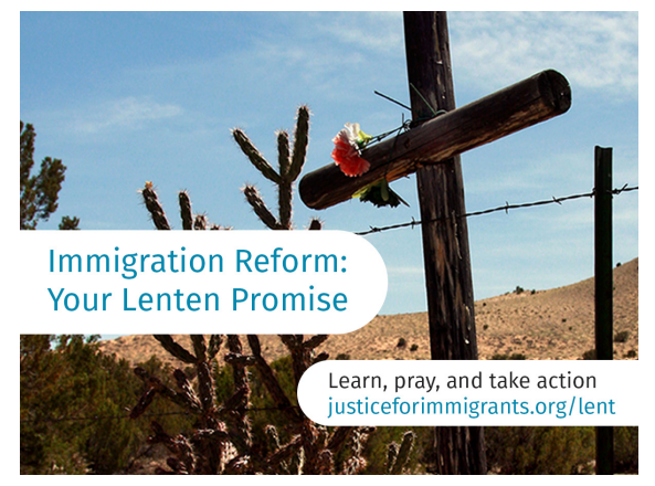
Example Facebook Timeline Image

For ideas on how to use social media resources and to stay up to date on immigration news, connect with JFI online.